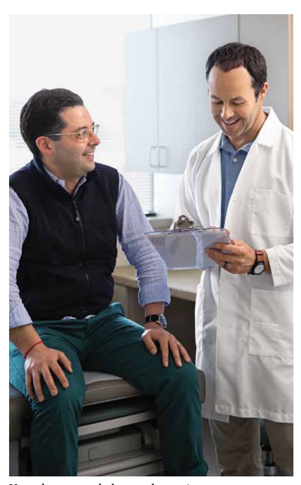
Your doctor can help you determine your current health status and detect early warning signs of more serious problems.

Always present your Blue Shield ID card before receiving services and verify that your provider is in the preferred network.